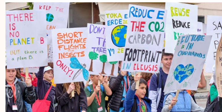
Calderone Art Space