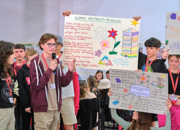
Calderone Art Space