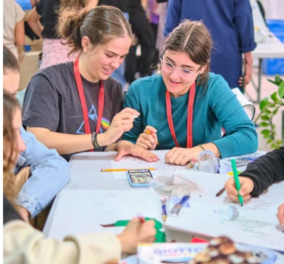
Calderone Art Space